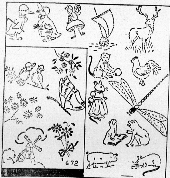
DESIGN NO. X 672

birds, beasts and flowers, residents of the barnyard and forests serve as motifs for towels, aprons, curtains and children's clothing. Hot iron transfer pattern No. X 672 contains 20 motifs, averaging about 3 by 4 inches each, with complete instructions.