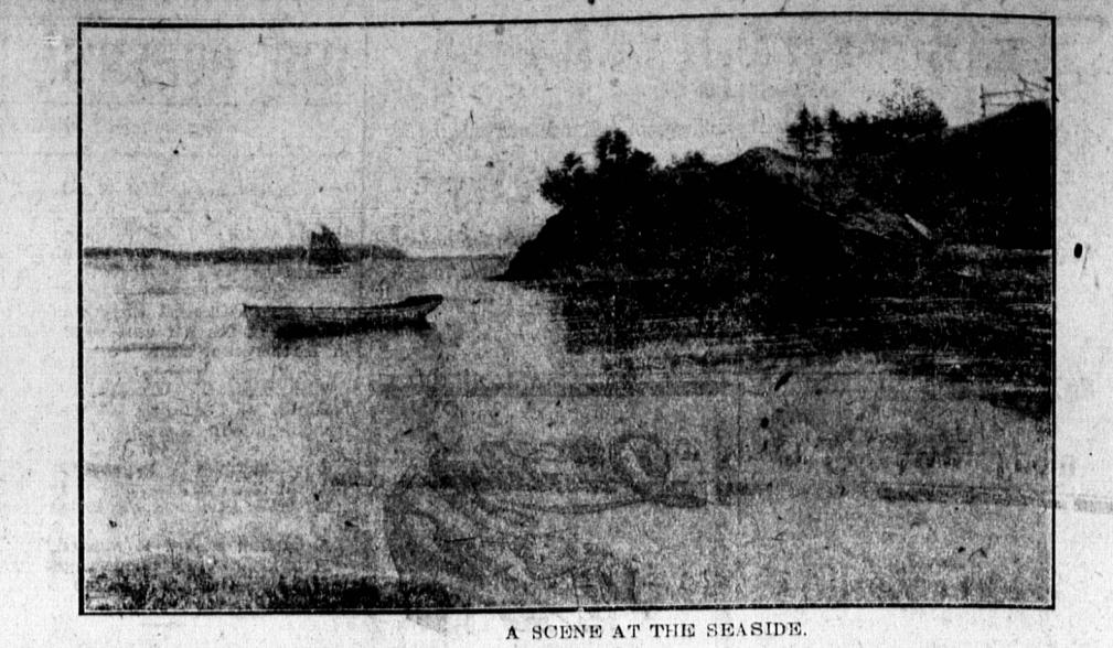
A SCENE AT THE SEASIDE.