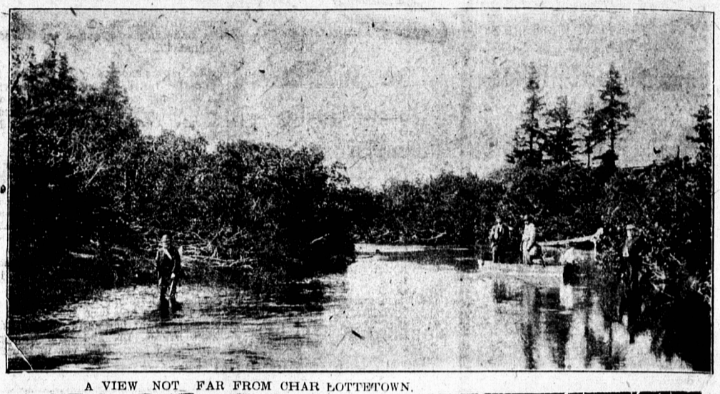
A VIEW NOT FAR FROM CHARLOTTETOWN.