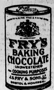
Recipes on Tin

FOR sister's party be sure you have a chocolate cake. Even if the cake itself is simple, the dainty coating of FRY'S Baking Chocolate icing will make it quite distinguished, and irresistibly delicious to everyone.