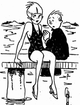
HE'LL HAVE TO She: Will you love me in December as you do in May? He: I'll say so! That's a colder month.