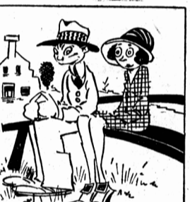
"I feel like raising the roof." "Well, a good roof garden is the place for doing that."