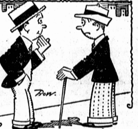
"I'm always mixed up with some girl, although I try to use my head." "Quit using your arms and you will be all right."