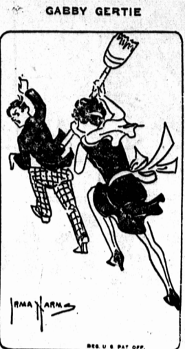
"When a girl takes after her 'daddy' there's usually a striking resemblance in her attitude."