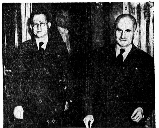
After conferring an hour behind closed doors in Rome's Quirinal Palace, Premier Alcide de Gasperi (left) and President Luigi Einaudi are seen as they left the building. At their meeting, the men are reported to have satisfactorily solved the crisis which had caused the De Gasperi cabinet to resign. The premier was asked to form a new cabinet.