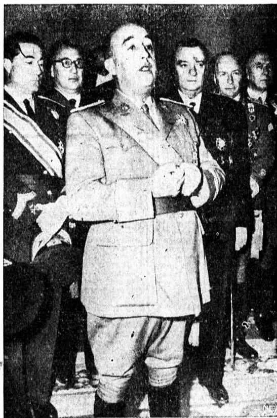
MAY DO BUSINESS YET — Moving into the international limelight again is Spain's Generalissimo Francisco Franco, centre, above, following Secretary of State Acheson's statement that the U.S. would support a resolution in the UN General Assembly to cancel the UN ban on member nations having diplomatic relations with Spain. This newest picture of the Spanish dictator was taken at a recent gathering of high government officials in Madrid.