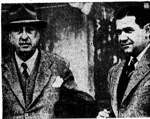
John Theotoki, named prime minister of Greece after the resignation of the Diomedes cabinet, is shown leaving the royal palace in Athens after he had been formally sworn into office before King Paul. He will head a caretaker government composed of non-political personalities until after the general election ordered by King Paul. With him (right) is Mr. B. Metaxas, head of the king's political bureau.