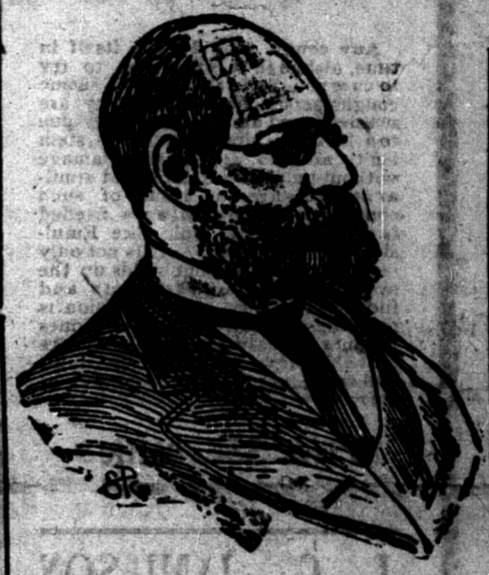
SIR RICHARD CARTWRIGHT.

Some time ago Sir Richard Cartwright expressed the opinion that the best way to obtain reciprocity was by reciprocal legislation and favored taking the duty off coal and some other articles.