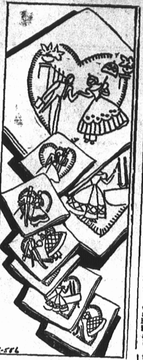
DESIGN X 556

Hearts are the order of the day, and needlework is no exception. The two large hearts, one with the figure of a young girl, and the other with the boy and girl, are ideal for pillows, luncheon and tray cloths, and luncheon and tray cloths.