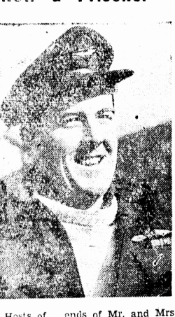
HON. J. L. RALSTON

OTTAWA, Nov. 1 (CP)—Defence Minister Ralston has resigned from the Federal Cabinet, it was learned reliably tonight.