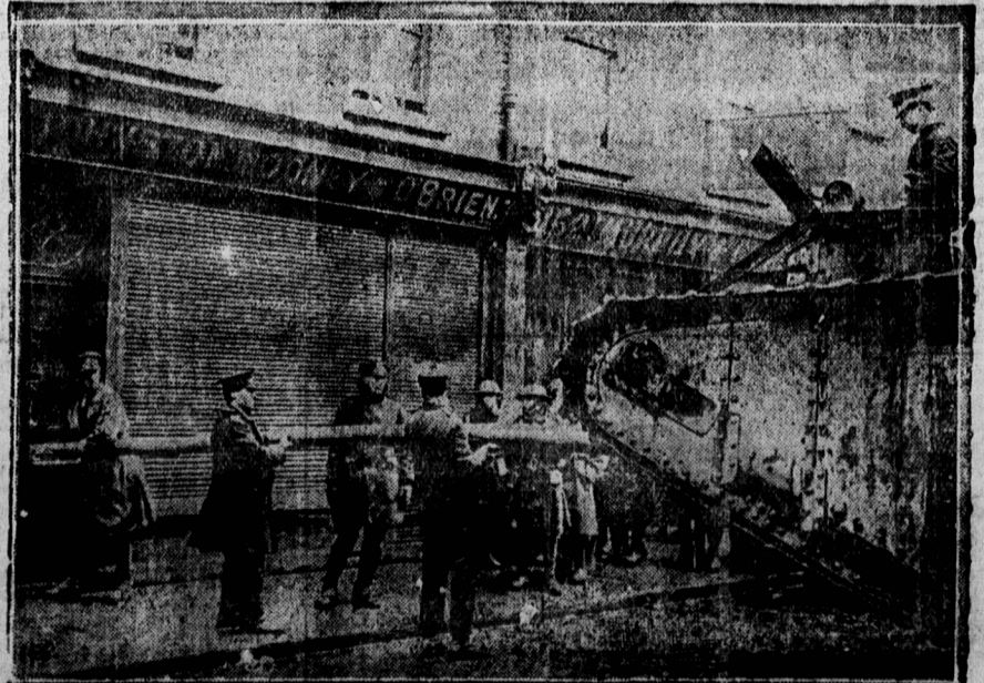
Warlike operations and search continue unabated in the beleaguered area of Dublin, according to reports received here. Whole streets are deserted and all shops closed. Shops and houses in the district are being searched for arms. The photograph shows how British troops use the fighting tanks to batter down locked doors.