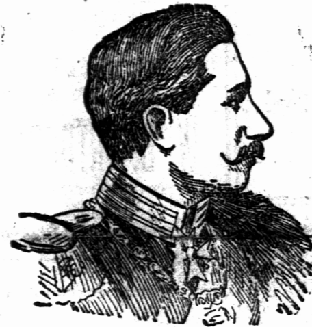
THE EMPEROR OF GERMANY

BERLIN, August 28.—(Special.)—The King of Italy, accompanied by the Emperor and Empress, Crown Prince Frederick and other dignitaries, made a state entry to