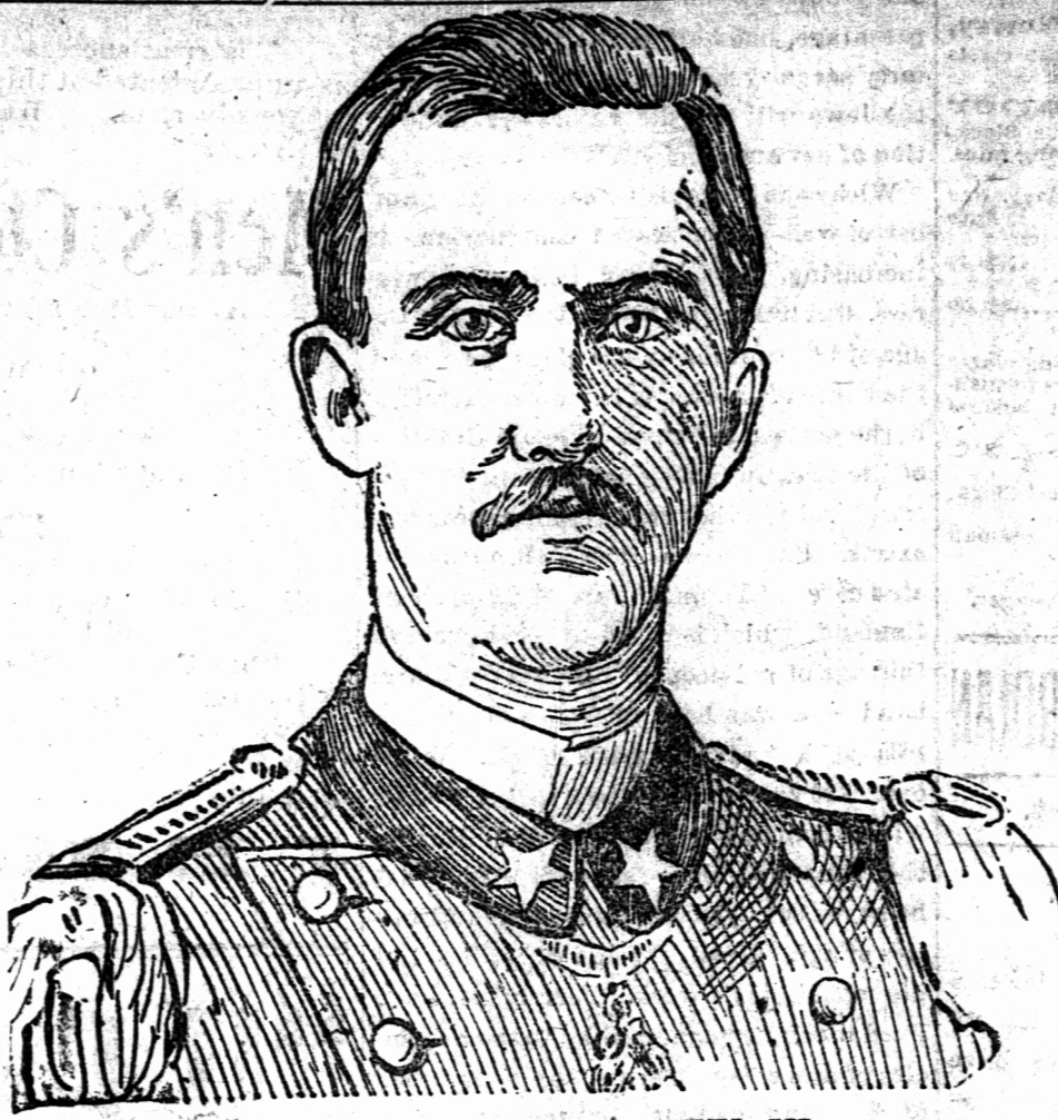
KING VICTOR EMMANUEL III.