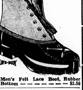
Men's Felt Lace Boot, Rubber Bottom — $2.50