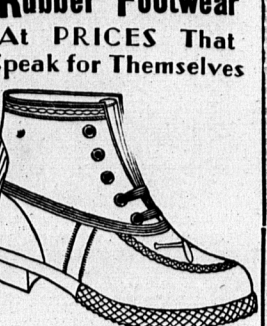
Gum Rubbers — Red Sole Men's $1.49, Boys' $1.09, $1.29