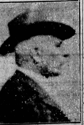
A MODERN COUNT OF MONTE CRISTO