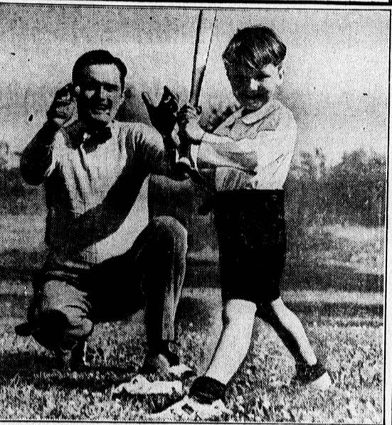
Excellent likenesses, and a "story idea," make this picture a fine example of a good informal portrait snapshot.