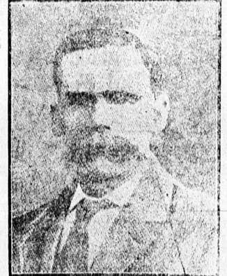
FRANK OLIVER, Minister of the Interior.