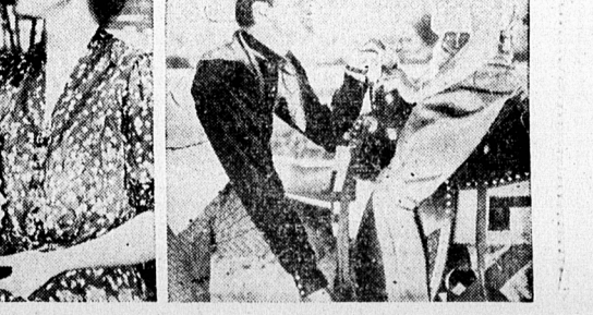
ada, at LEFT, are Clark Gable and his wife, Carole Lombard; CENTRE, Spencer Tracy and his wife; RIGHT, Gary Cooper and his wife, Sandra Shaw. The novelty of visiting a country engaged in a great war and the fact that Americans obtain a substantial premium on their money are among the factors expected to attract nearly 20,000,000 touring Americans during the coming season.