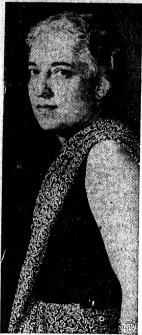
Mrs. Vijaya Lakshmi Pandit, above, India's ambassador to the United States, succeeding Sir Benegal Rama Rau. Mrs. Pandit is the sister of India's Prime Minister Pandit Jawaharlal Nehru.