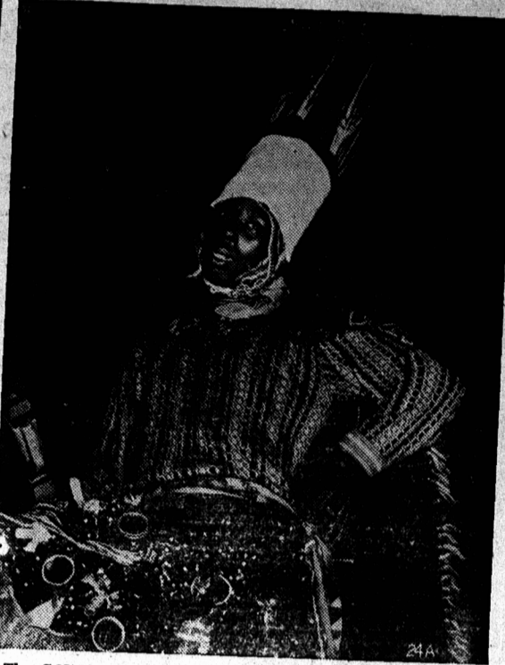
The GOMBEY CHIEF dominating the barbaric dance...