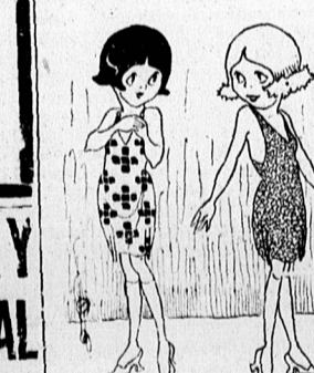
"A diamond is the hardest stone, isn't it?" "Yes—to get."