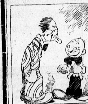
SWELL SIGHT "Hey, want to see something swell?" "Sure." "Just drop this little sponge in some water then."