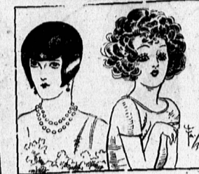
THE PLACE AND THE GIRL "Have you a court yard?" "No, I do my courting indoors."