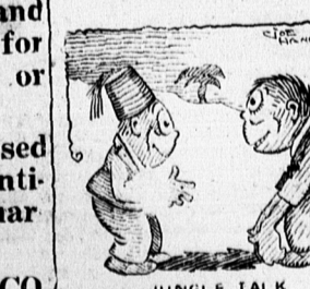
JUNGLE TALK 1st Monk: My brother is going to open a store 2nd Monk: More monkey business, eh?

"DIAMOND DYE" ANY GARMENT, DRAPERY Just Dip to Tint or Boil to Dye