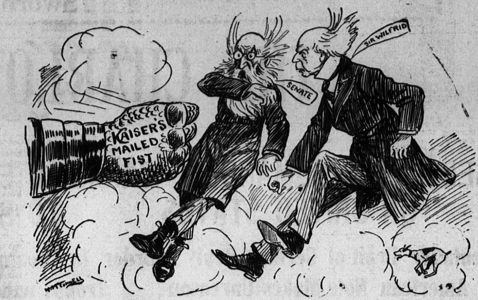
THE "EMERGENCY" SIR ROBERT BORDEN WARNED THEM TO HELP HIM PREPARE TO MEET"