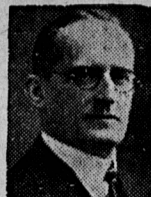
By James W. Barton, M.D. REST AND WEIGHT

ments, 4 tablets and 15 fences; Ontario, 28 cairns, one boulder, five monuments, 63 tablets and 19 fences; Western Provinces, 33 cairns, two boulders, four monuments, 43 tablets and 11 fences.