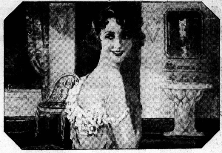
Bebe Daniels (Paramount) and the bathroom her charm inspired

The School Staff consists of the following:—