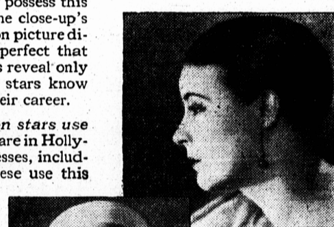
VIRGINIA VALLI, the beautiful star, says—"I delight in the marvelous velvety way Lux Toilet Soap leaves my skin."

MERNA KENNEDY, lovely Universal star, says—"Lux Toilet Soap keeps my skin marvelously smooth."