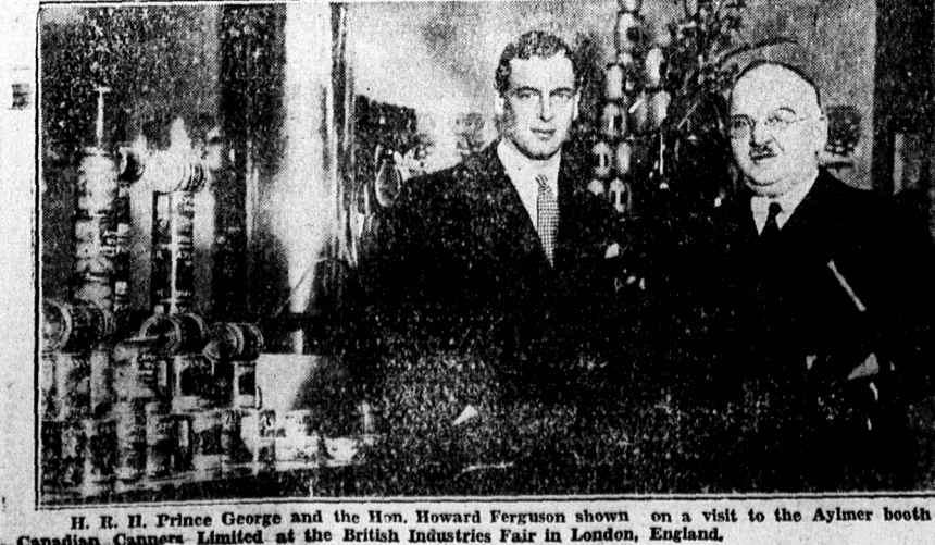
H. H. Prince George and the Hon. Howard Ferguson shown on a visit to the Aylmer booth of Canadian Camera Limited at the British Industries Fair in London, England.