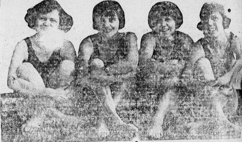
ACQUIRING A TU-TAN.—Four Toronto damsels submitting themselves to the "Tu-tanning" which is absolutely le dernier cri in bathing fashions. Strips of adhesive tape, in any preferred sign, are worn on the arm, while the bather exposes herself to the sun. When she is duly tanned the tape is removed, and a patch of clear white skin stands out in the centre of the brown.

LONDON July 29.—Professor W. Flinders Petrie, the eminent Egyptologist who was recently knighted by King George, gives some interesting information regarding the private life of the ancient Egyptians. The earliest marriage contract known in Egypt he says dates from 590 B. C. The terms of the pact, as drawn up by the husband, were as follows: "Since God willeth that we should unite one with the other in rightous wedlock, after the manner of every free man and every wise woman, therefore I have given thee four dollars in gold as a bridal gift, that thou mayest come and enter my house as a free woman. And for my part I will not neglect thee more than as if were my own body. Neither shall I be able to put thee forth without cause, having legal ground. But should I wish to put thee forth, I will pay 17 dollars for the matter."