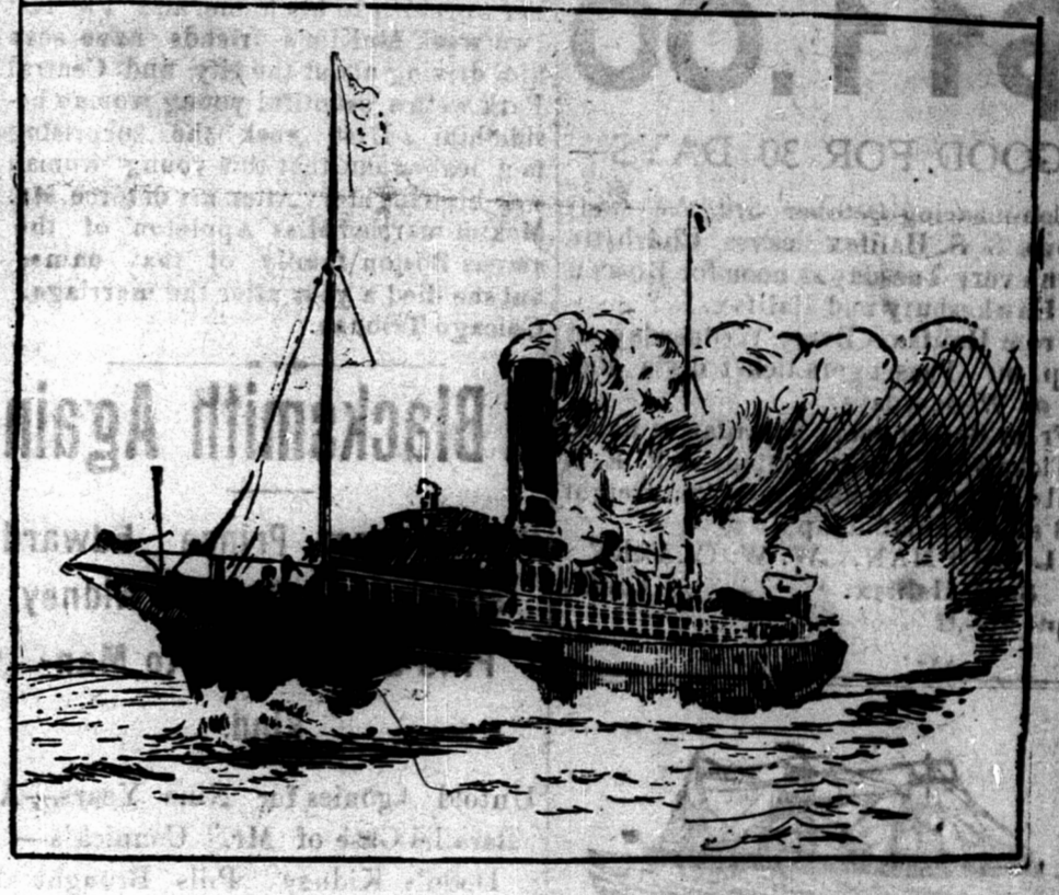
THE S. S. BRUCE. Flying between Sydney and Port Au Basque.