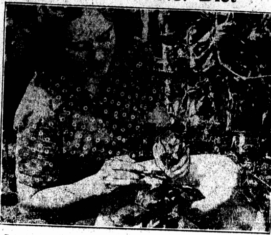
Cut only tender tips of New Zealand spinach to use for greens

Nutritionists continue to chorus: "Eat more green, leafy foods." The average diet, they insist, is deficient in these vitamin and mineral-rich vegetables. An abundant supply all summer long can be grown in the home garden, by sowing Swiss chard and New Zealand spinach, which quickly reach usable size, and continue to produce new leaves until freezing weather kills them.