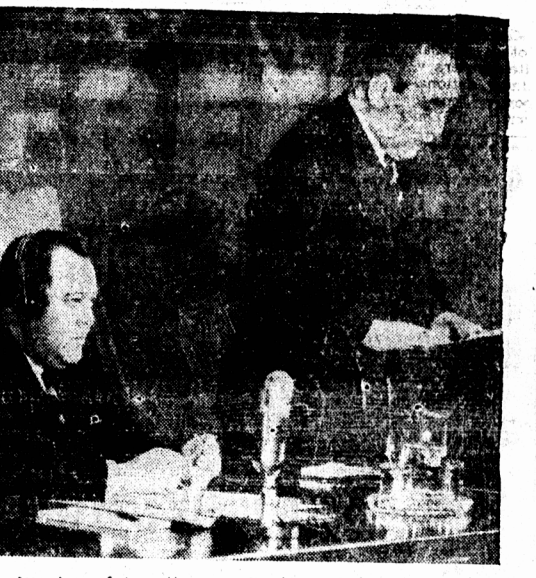
Dr. Jose Arce of Argentina, new President of the UN General Assembly, addresses a session at Flushing, N.Y., called to consider the Palestine question. Dr. Arce's election came as a surprise. He reportedly was the behind-the-scenes choice of Great Britain and Arab nations. At left is UN Secretary-General Trygve Lie.

Eastern Canada Distributors—ROY C. LEWIS, LIMITED, MONTREAL, QUE.