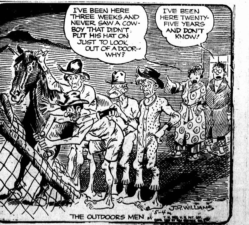
THE OUTDOORS MEN