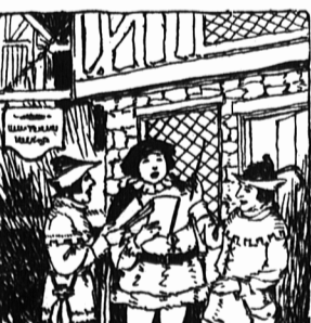
Carols Sung by Waits Who Went From House to House

And the sun and the wind they told me there How goodly a load the three ships bear, For the first is gold and the second is myrrh On Christmas Day, on Christmas Day; And the third is frankincense most rare On Christmas Day in the morning. They have mixed their shrouds with the golden sky, They have faded away where the last dreams die, Ah, yet, will ye watch, when the mist lifts high On Christmas Day, on Christmas Day? Will ye see three ships come sailing by On Christmas Day in the morning? —ALFRED NOYES.