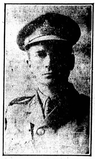
Parliamentary Assistant Minister For Air

Our Four Island Representatives—three of them went through the crisis with Mr. King; they know him and were by his side through it all.