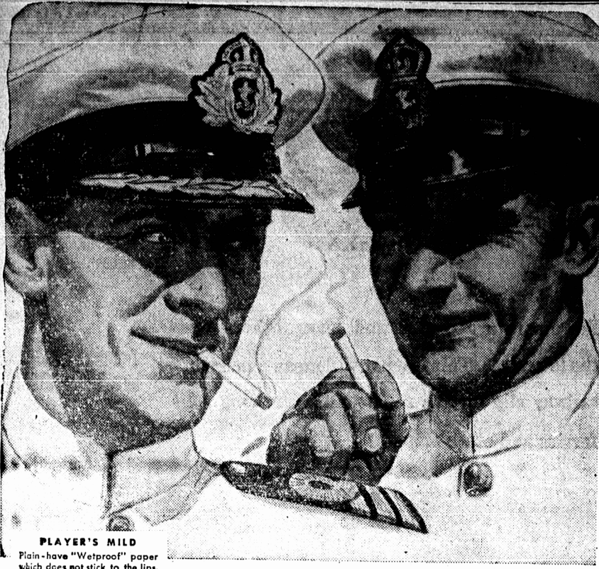
PLAYER'S MILD Plain-taste "Wetproof" paper which does not stick to the lips.