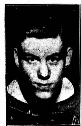
PLAYS FOR CANADIENS OF THE N. H. L.