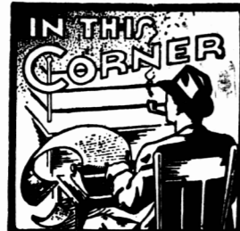
IN THE CORNER

Prince of Wales Welshmen make their final bid tonight in the City Hockey League to gain a playoff berth. The City Collegians meet the St. Dunstan's team, regarded by many the strongest team in the loop.