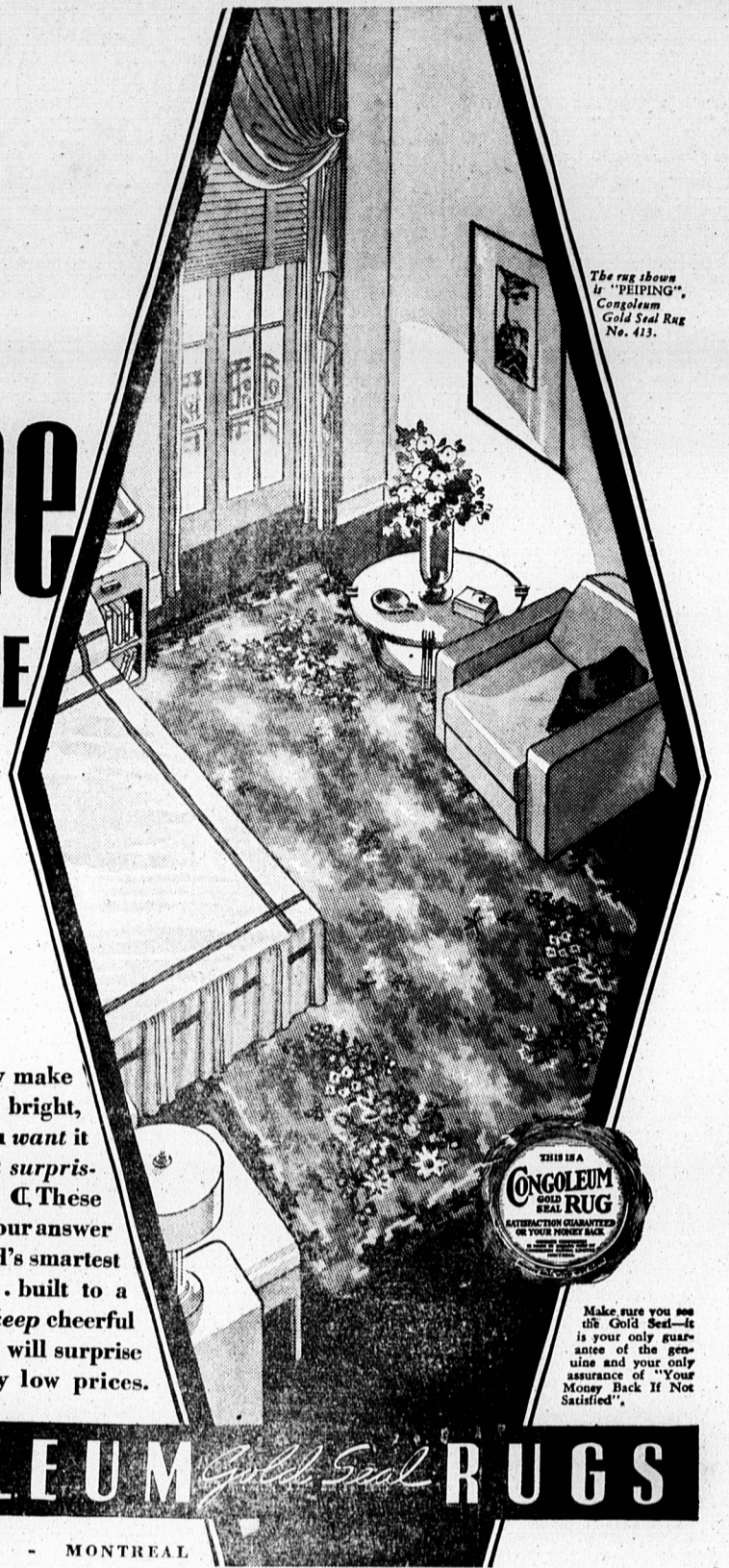
The rug shown is "PIPING", Congoleum Gold Seal Rug No. 413.