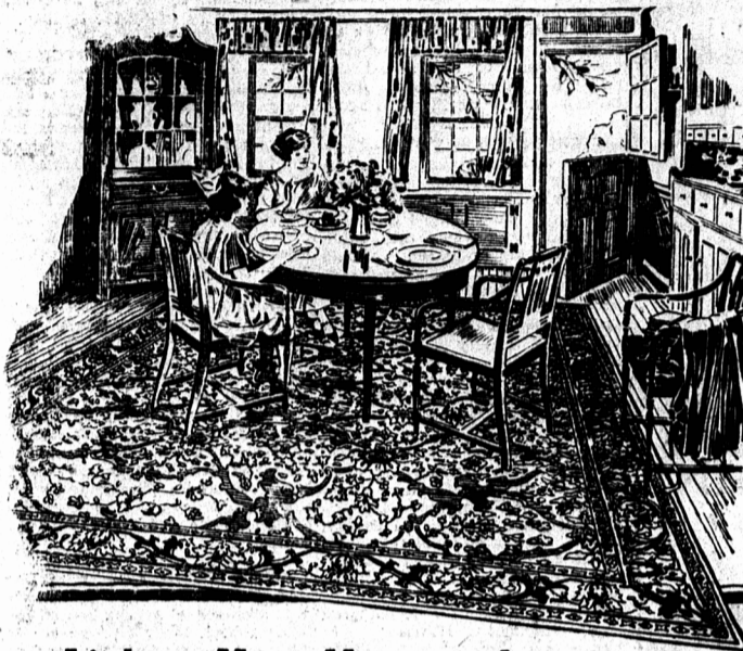
Naturally, the black and white reproductions of the patterns shown can give no more than a faint idea of their actual beauty and charm. The pattern shown on the floor is Gold-Seal Congoleum Art-Rug No. 532. It is a cheerful design in which tan and blue predominate. In the 9x6-foot size it costs only $9.00.