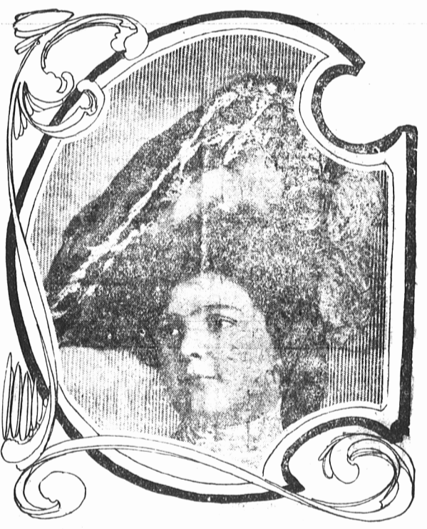
NEW ACCEPTATION OF THE PICTURE HAT.

WINNEPEG, Oct. 12.—Tens of thousands of business offices, the great Northwest Hotel, the Opera House, and the Dufferin block adjoining Bull Run block, are all partly damaged. The chief sufferers in these blocks are the Sater Shoe Company, the Granby Music Company, Calbers, photographic supplies, Davies' stationery, sock and Connolly's drugstore. Rialto block was saved after a hard fight. The fire had such a start that anything that could be done was but of little avail. Electric light and power services are all cut off owing to the fire and all newspaper offices were in darkness till midnight. The Free Press office in the rear of the Bull Run block escaped injury. The loss is estimated at over $800,000 of which the Ashdown company will lose $570,000.