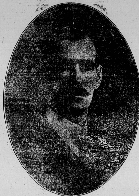
HON. JOHN A. MACDONALD Conservative Candidate for Kings