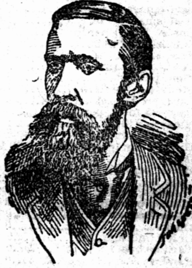
HON. GEORGE EULAS FOSTER, B.A., D.C.L., P.C.