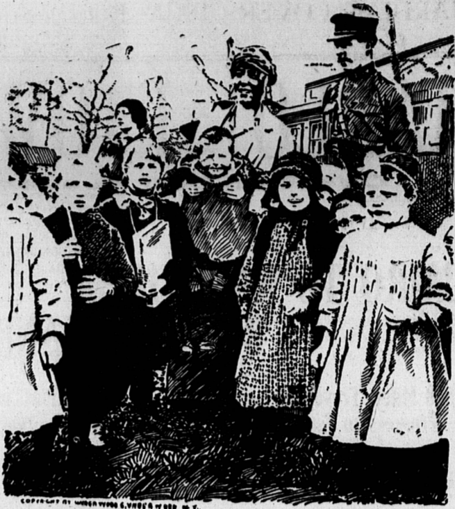
CHILDREN ORPHANED BY GERMAN BRUTALITY