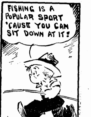
FISHING IS A POPULAR SPORT 'CAUSE YOU CAN SIT DOWN AT IT!

These dozen stations comprise little settlements of anywhere from