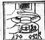
JUST strike a match and light it—as easy as lighting the gas.

Get a copy of the new Perfection Heater folder.