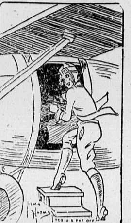
"The only way to keep from getting into a rut is to rise above your surroundings."