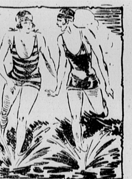
"We were all on the beach in our bathing suits, and one of those horrid newspaper photographers came along and took snapshots of us." "The wretch!" "Yes. And I've bought his paper every day since then, and he hasn't printed my picture at all!"