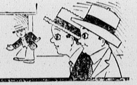
"Blower certainly talks a great deal about himself, doesn't he?" "Yes. He evidently believes that the most trifling topics may be made interesting if properly handled."