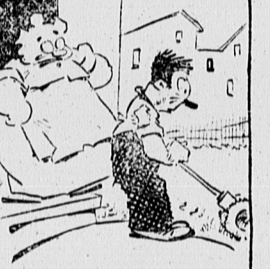
"When you finish mowing the lawn you can trim the trees and then you can hoe the garden, and then—" "I'm sorry I ever put this place in your name. Now you can boss me around as you please."