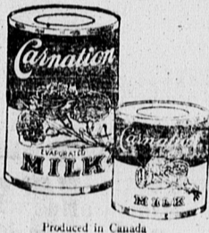
Produced in Canada

IF you want the richest, smoothest fudge or other candy, use Carnation Milk. All foods made with milk or cream are smoother and richer when Carnation is used—just pure, whole milk evaporated to double richness and sterilized. It keeps. It is always the same. It saves butter and cream. (See recipes above)