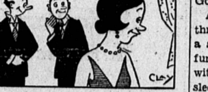
"Her face is against her." "Yes; I think it's 'way off.'"