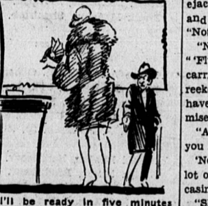
"I'll be ready in five minutes dear." "All right, then I'll slip out and be back in an hour."