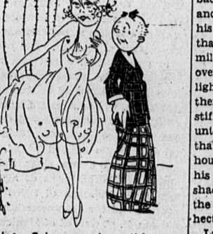
He: Going anywhere this evening? She: You should know. You're taking me.