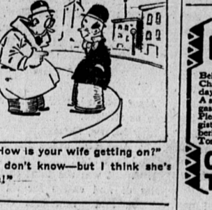
"How is your wife getting on?" "I don't know—but I think she's wise!"