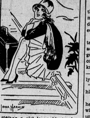
"When a girl is on his track a man is often railroaded into wedlock."