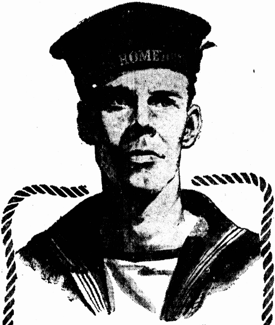
"THE NAVAL RESERVIST"