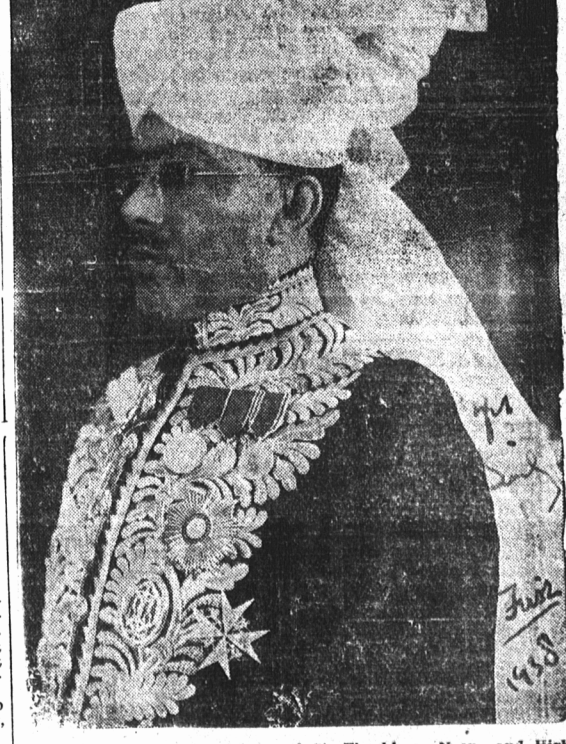
This autographed picture of Sir Firoz Khan Noon and High Commissioner for India in Great Britain, who recently toured Canada, is his most recent portrait.