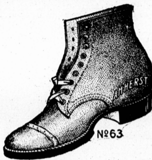
A Farmer's Boot

We show here a cut of Men's strong land boots with good heavy Kip or Grain Leather upper—top soles—sole leather counter—strong waxed linen thread seams