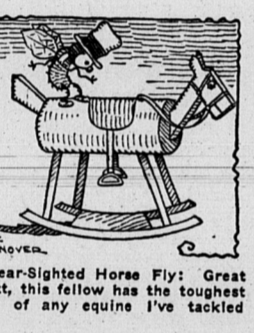
Near-Sighted Horse Fly: Great Scott, this fellow has the toughest hide of any equine I've tackled yet!