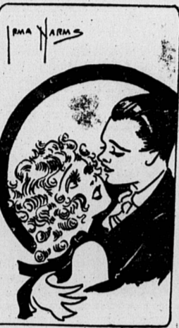
"The girl who doesn't mind when a man pets certainly wouldn't if he didn't."