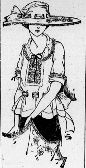
Tailored Linen or Cotton Frock for Summer.

ton crepe dresses are similarly trimmed with good effect. Cotton crepe has played a big part in the development of children's frocks for several seasons.