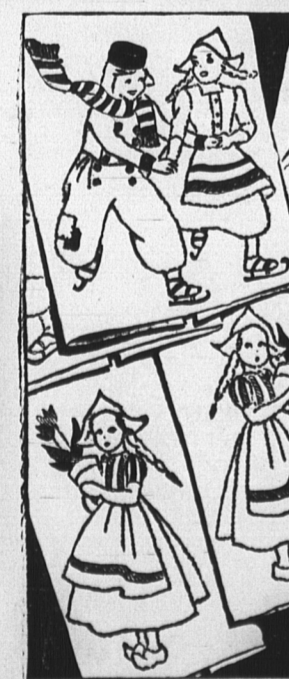
DESIGN NO. 519

These little Dutch boys and girls are embroidered in simple stitches in gay colors. Suitable for towels, pillows, etc.