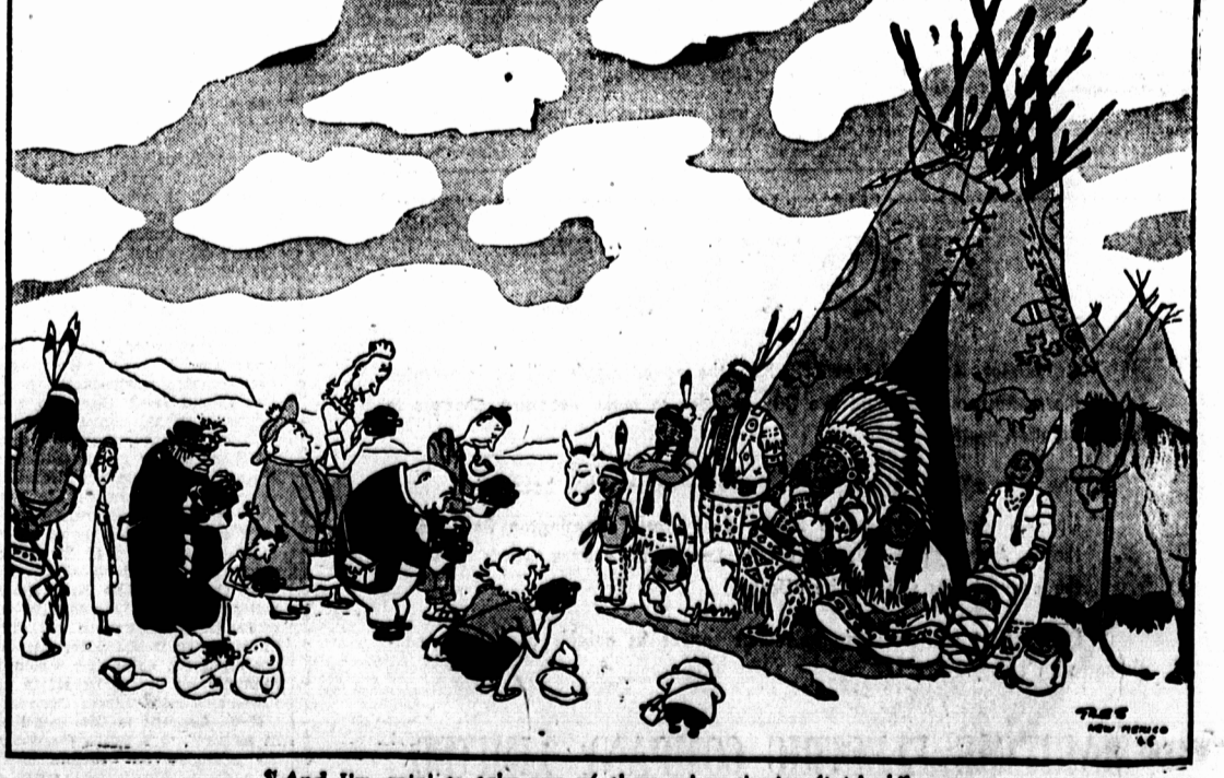
"And I'm goin' to take one of them when they've finished"