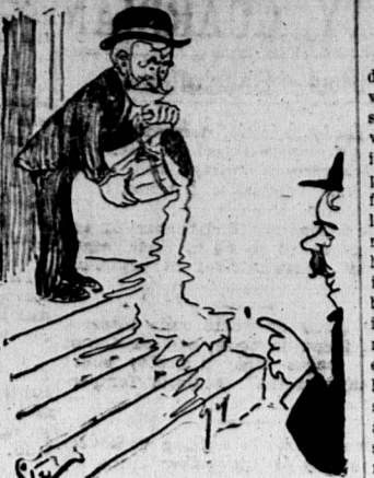
"But how could he drink in her beauty?" "Through his eye glasses, of course."