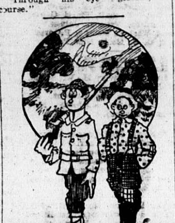
Pessimist-Say, I thought you lived near the depot. Optimist-There's more'n one depot in this world, isn't there? Pessimist-It don't look like it!