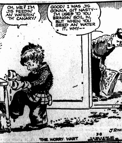
THE WORRY WART