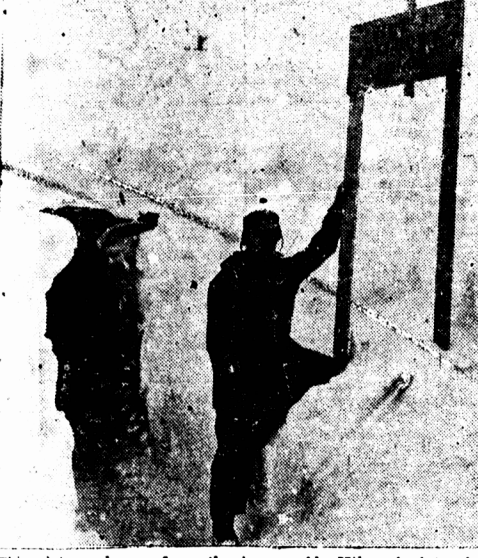
This picture shows where the inescapable Kilroy had to show up.