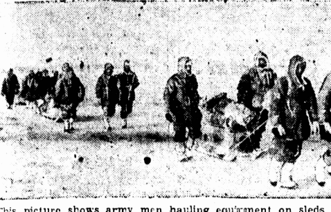
This picture shows army men hauling equipment on sleds across the frozen wastes.