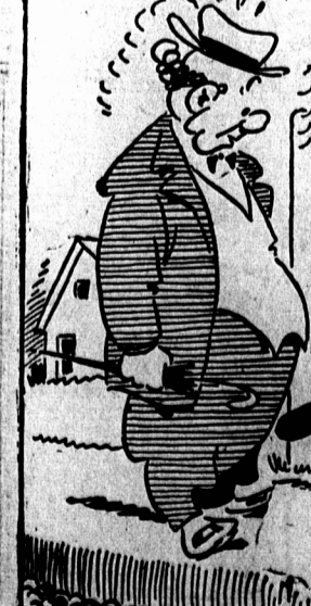
"I was very cleverly tricked into this—the Guardian went and said it was a musical toy."