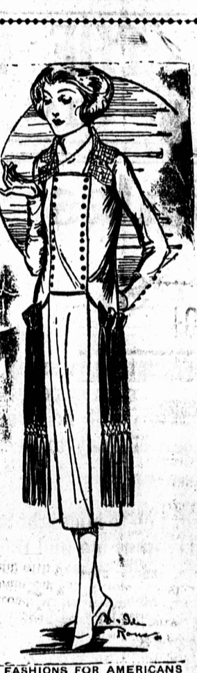
The little frock shown in the

sketch is made of navy serge with side panels of black satin finished with deep silk fringe. The buttons are black satin covered and pipings of the satin are set on the bodice to simulate a redingote. The sleeves are long, closely fitted and but- ton trimmed. This dress features the low waistline so strongly com- mended for the coming season, and it is interesting because, like many others now being brought out, it immediately opens up possibilities to the economically inclined woman who is trying to make a last season dress into one of this year's vintage.